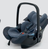
Deep Water Blue